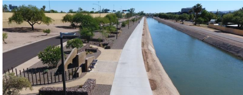
Grand Canalscape, Phoenix