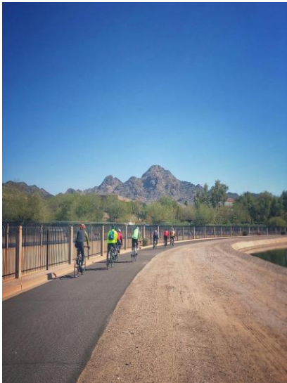
Canal Walks, Phoenix