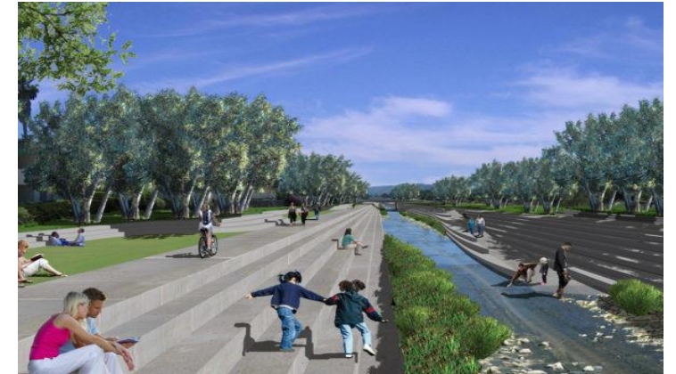
Verdugo Wash Glendale CA Rendering