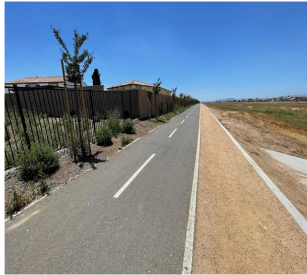
Perris Valley Trail