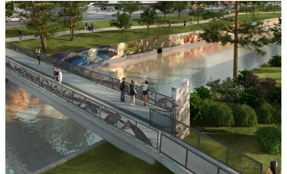
The Great Wall of Los Angeles