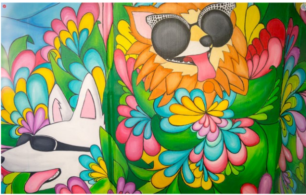
Thorton Park / Orlando