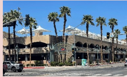
Corner of Indian Canyon at Baristo

The Baristo Garage Team members conducted Safety Audits to uncover design elements that might support potential criminal activity, for example a lack of "natural surveillance", or a dark corner that could serve as an "entrapment area".